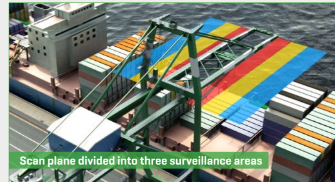
Scan plane divided into three surveillance areas