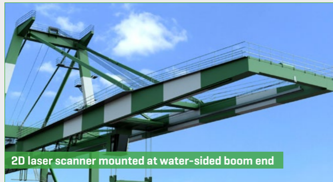
2D laser scanner mounted at water-sided boom end

The application LaseBCP Boom Collision Prevention is a two-dimensional laser measurement system which observes the area around the boom of quay cranes during gantry travel. In case of detecting an obstacle on the vessel like e.g. bridge, radio antennas etc., a signal is provided to the crane control PLC in order to slow down or stop the crane movement before any collision can occur. The system is built especially for the use at STS vessel operations and prevents significant damages, crane down-times and particularly dangerous accidents.