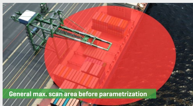
General max. scan area before parametrization

The main advantage of this system is the smart handling where detected objects are analyzed by their lifetime and spatial expansion. If both exceed pre-defined threshold values, the object is indicated and stored. This ensures a reliable system performance and avoids false alarm by e.g. birds, rain drops or snow flakes.